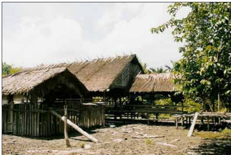
Picture 2. Uma Mentawai in Siberut Island (Photograph by the author, 2004).