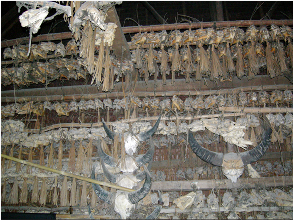
Picture 2. Pig skulls and buffalo horns are kept in the communal house ( uma ) of the Sakuddei kin group in the upriver village of Sagulubbe (photograph by the author, 2006).

A crew from England making a documentary film and I were in Simatalu in 1998 when a father of a family performed the ritual for his son’s new house. We were allowed to experience the entire process and make a documentary of it (Wawman 1999). We witnessed the father sacrificing four pigs for his son’s new house and for his son’s wife who was pregnant. The father “read” a prediction of good luck, good health and prosperity for his son and the rest of the family when he examined the hearts of the ritually blessed and ritually slaughtered pigs. This sort of augury is not limited to pigs, Mentawaians might also read their fortune by examining the intestines of ritually blessed and ritually slaughtered chickens.